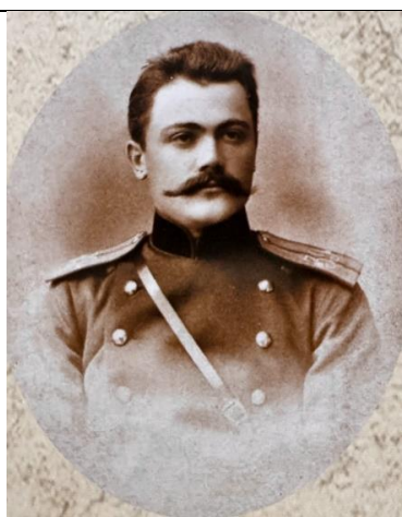
Kote Abkhazi (1867-1923)