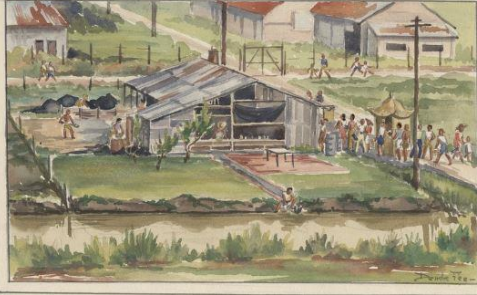
Artwork Courtesy of UVic Archives