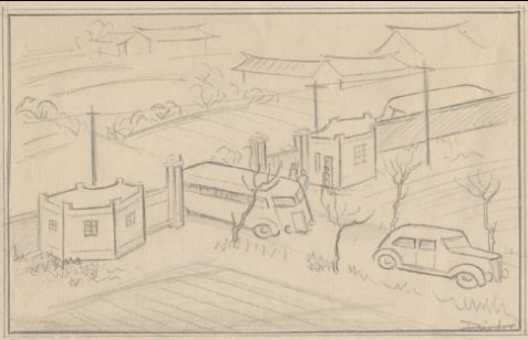
P.F.C. arrives at Lunghau /