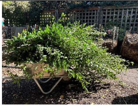
One of many wheelbarrows full of hornbeam cuttings Darren took to the service area.

After two seasons of volunteering, Darren has retired from volunteering in the garden.