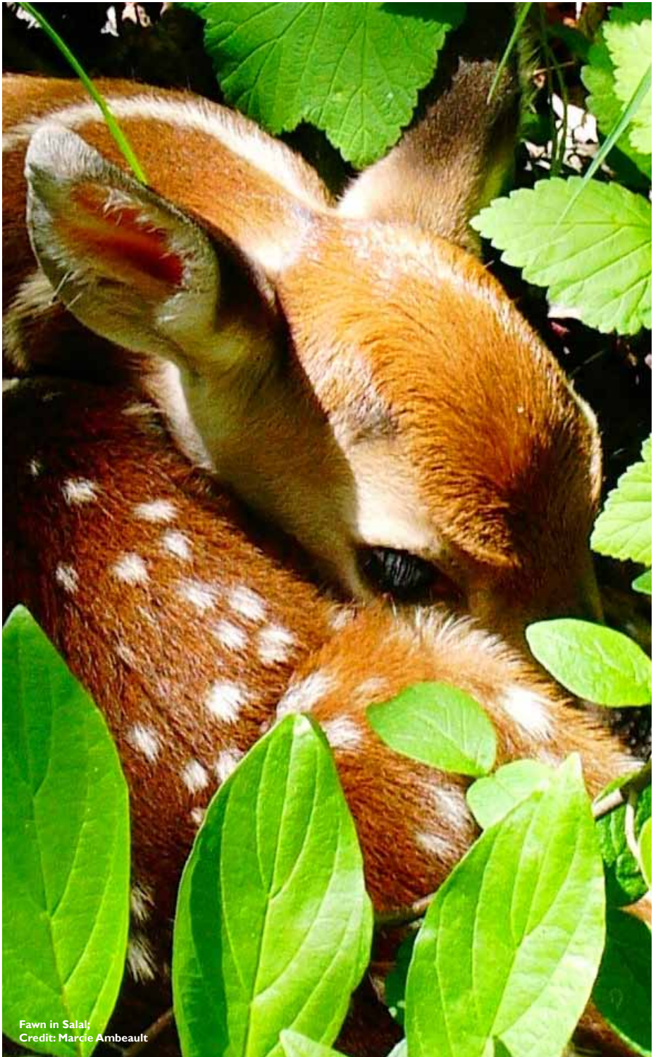
Fawn in Salah