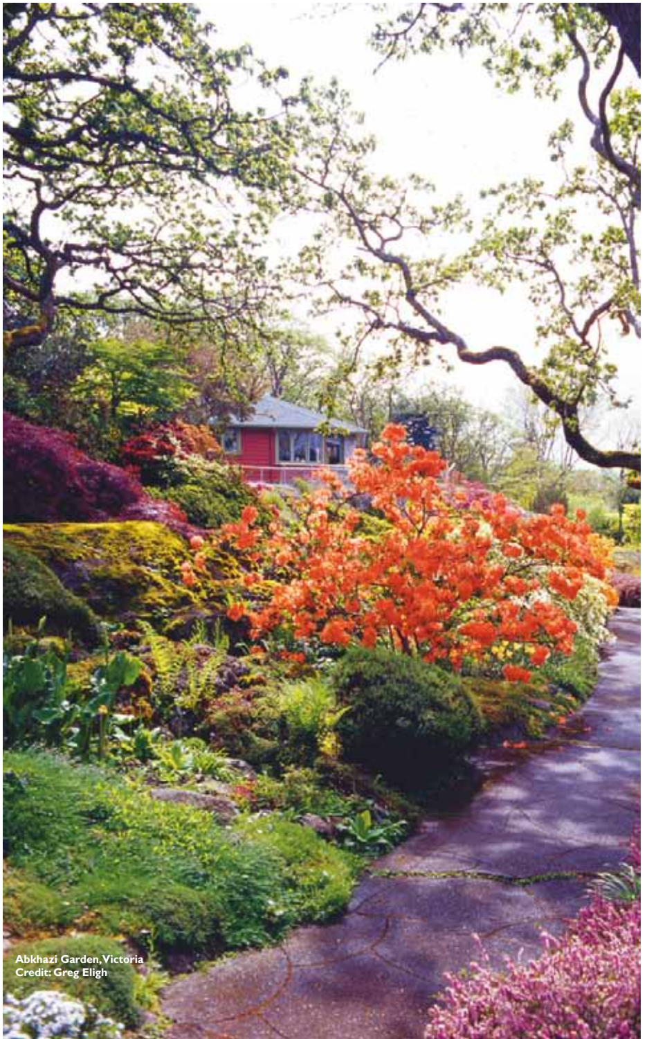
Abkhazi Garden, Victoria