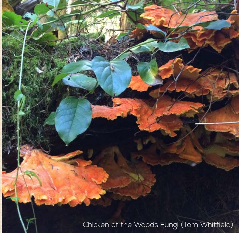
Chicken of the Woods Fungi (Tom Whitfield)

With your cooperation, the Heritage Forest will live as a legacy to the generations who follow us!