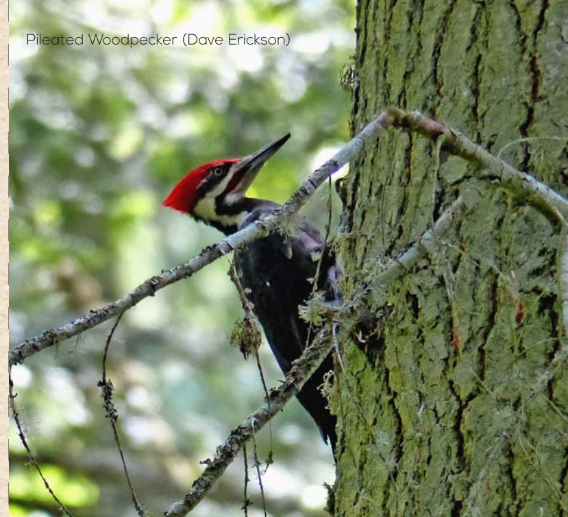
Pileated Woodpecker (Dave Erickson)

T ake a walk through the meandering trails of the 50-acre Qualicum Beach Heritage Forest. Enjoy the quiet solitude of this lush Coastal forest that has remnant pockets of old growth 400-year-old Coastal Douglas Fir along with Western Red Cedar, Hemlock, Grand Fir and Sitka Spruce as well as a number of endangered and rare plant species. Very little of the Coastal Douglas Fir zone forest is protected, which makes the Heritage Forest a rare opportunity to learn about and appreciate nature in a relatively untouched coastal forest. The natural environment of the Heritage Forest is home to rare and endangered plants such as Indian Pipe Monotropa, many species of birds including the Barred Owl and Pileated Woodpecker, and the salmon-bearing Beach Creek. The Heritage Forest is protected by a Conservation Covenant to ensure that it remains as an ecological reserve, available for all to benefit in perpetuity.