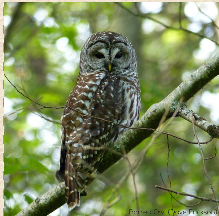
Barred Owl (Dave Erickson)