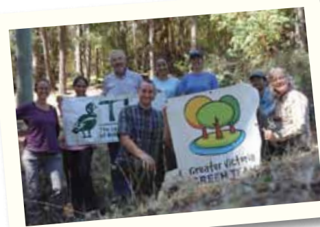
Greater Victoria Green Team and TLC volunteers pose for a quick pic after a day of restoration work.