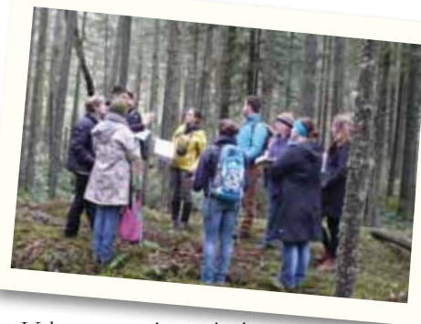
Volunteers practice monitoring a rocky outcrop dominated by Douglas-fir, arbutus and mosses.

Want to get involved? Upcoming work parties include returning to the Atkins Road Covenant with the CRD November 5 th and December 17 th . We will be continuing our Scotch broom removal efforts in the Highlands next spring, as well as restoration at the Ayum Creek Park Covenant in Sooke. We are always looking