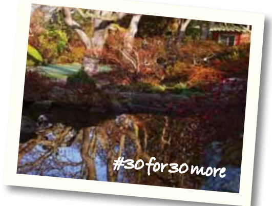
Below: Oak trees reflected in the pond.