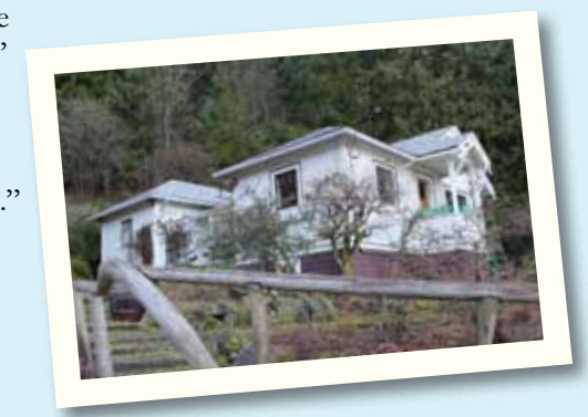
Lohbrunner Farm was successfully transferred to the FarmFolk/CityFolk Society this fall.