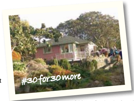
Above: Abkhazi Garden displays the change in seasons.

The Garden welcomed thousands of visitors from all around the world and from the local community this year. Many locals return week after week during the summer months to enjoy the different blooms. The fall months are just as beautiful and provide avid botanists and gardeners the quiet solitude of the winding paths, art displays and rare plant life. Abkhazi Garden and Teahouse are open Wednesday through Sunday throughout the fall and winter from 11:00 a.m. to 4:00 p.m. Be sure to come for a visit and enjoy the history and beauty that love built. ■