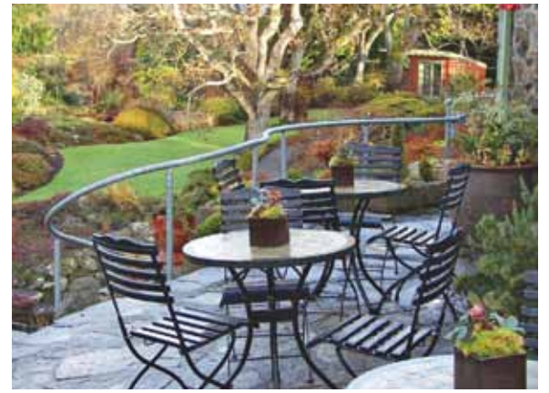
Abkhazi Garden is magnificent in every season and is the perfect place for a holiday gathering. Call 250-598-8096 for details.