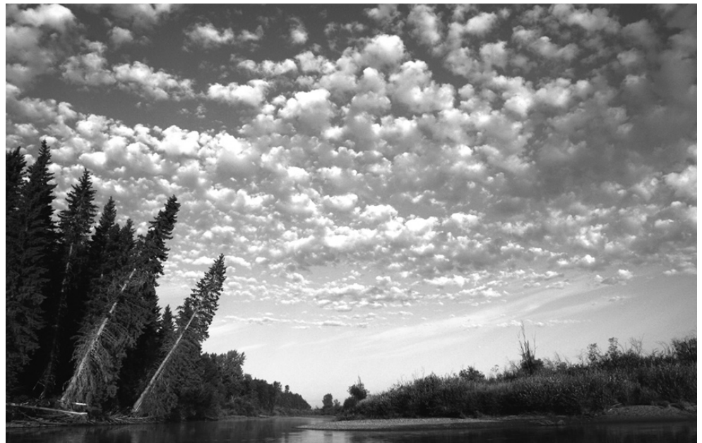
Saving special places like TLC's Horsefly River property helps protect healthy and diverse ecosystems that are vital to the survival of B.C.'s wildlife as they face the challenges of climate change.