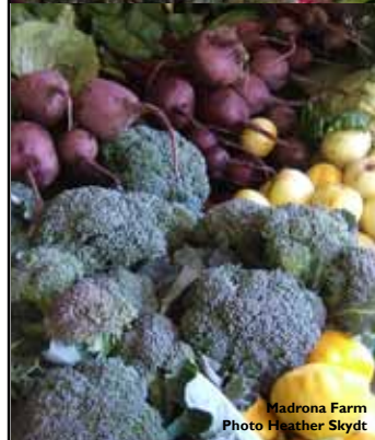
Madrona Farm