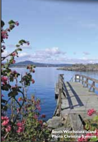
South Winchelsea Island

Abkhazi Garden, Victoria (0.6 ha) Cowichan River Cabin, Cowichan River (2 ha) Nanaimo River #1, Nanaimo (16.2 ha) Similkameen River Pines, Cawston (51.4 ha) Talking Mountain Ranch, Big Bar (404 ha) Horsefly River Riparian Conversation Area #2, Horsefly (300 ha)