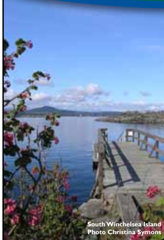
South Winchelsea Island

Luke Creek Wildlife Corridor #2, Kimberley (127.1 ha) Wild Hills and Beaches, Sooke & Jordan River (2,347 ha) Clearwater Wetlands, Clearwater (32.4 ha) Horsefly River Riparian Conservation Area #5, Horsefly (56.6 ha) Gowlland Point #2, Pender Island (0.6 ha)