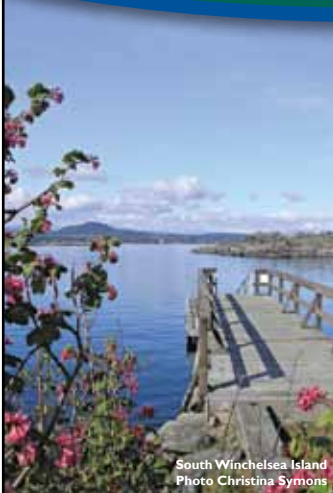
South Winchelsea Island