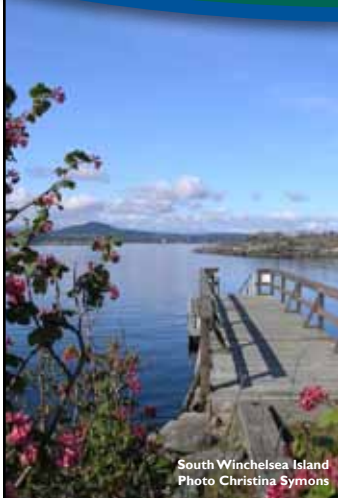
South Winchelsea Island