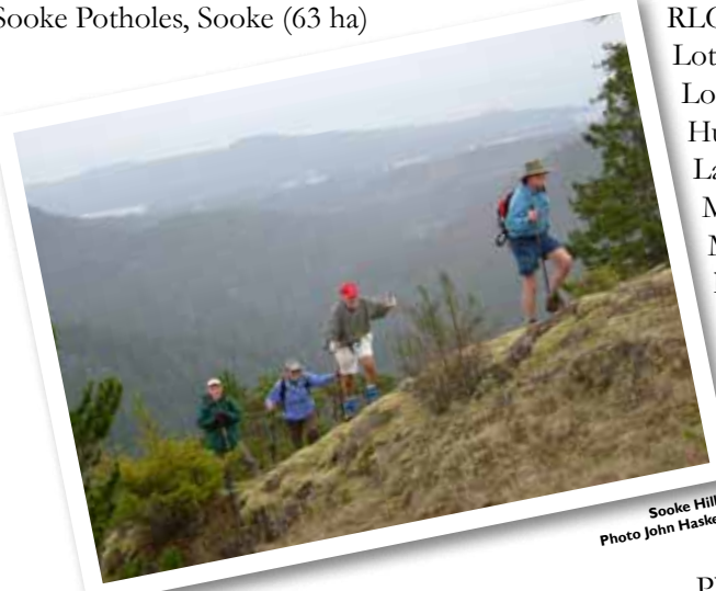
Sooke Hills