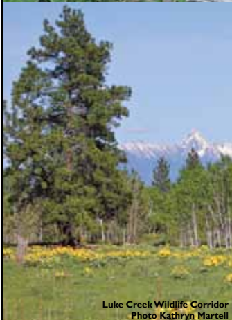
Luke Creek Wildlife Corridor