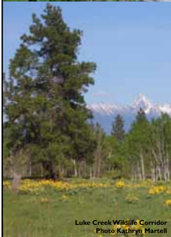
Luke Creek Wildlife Corridor