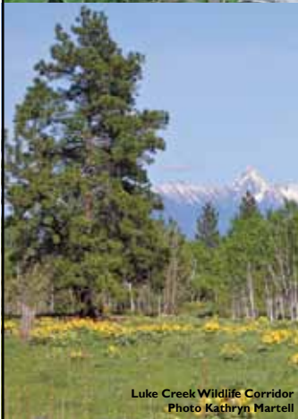
Luke Creek Wildlife Corridor