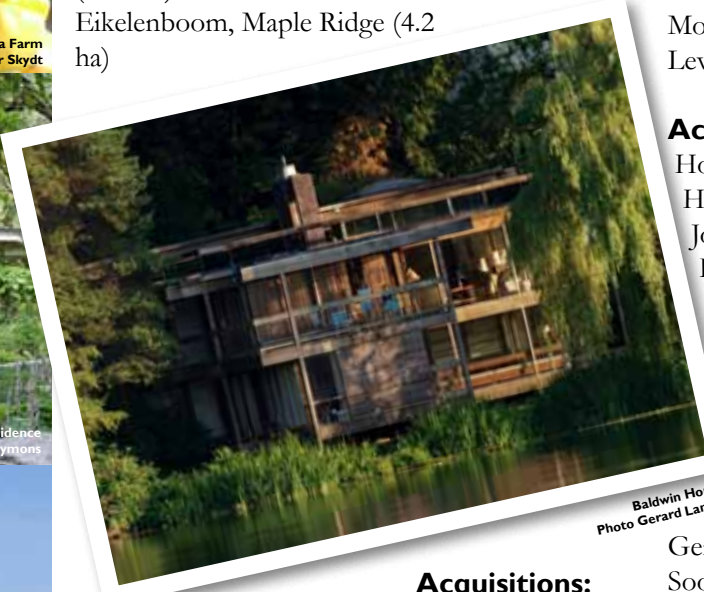
Baldwin House

Camas Hill, Metchosin (6.8 ha) Caromar, Duncan (26.7 ha) Havenwood, Colwood (16.5 ha) My Whim, Salt Spring Island (2.2 ha) Yellow Point Lodge, Cedar (27.4 ha)