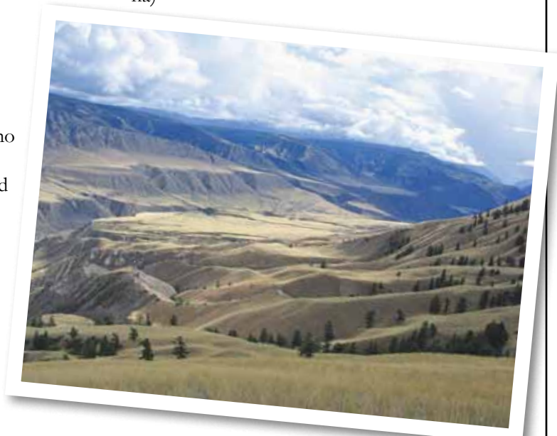
Talking Mountain Ranch

Lehman Springs, Bridesville (24 ha) Avola Creek, Clearwater (3 ha) Centre Creek, Surrey (8 ha) Wycliffe Wildlife Corridor #3, Kimberley (119.5 ha)