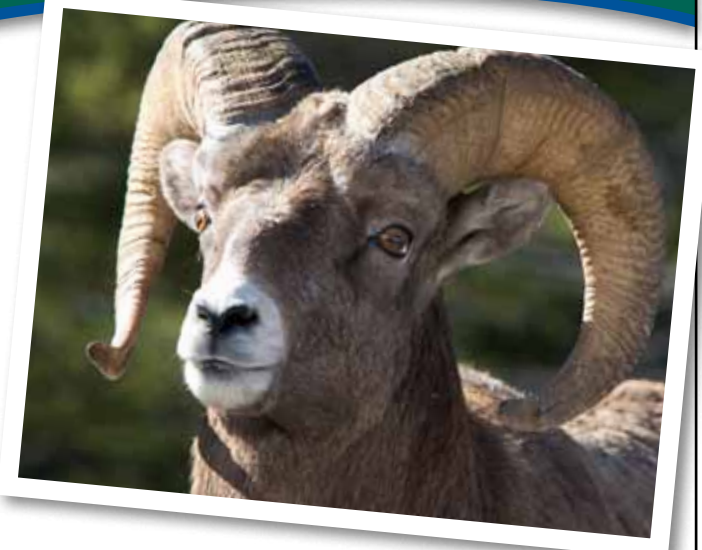
California Big Horn Sheep

Finlay Lake, Galiano Island (6.7 ha) Andreas Vogt Nature Reserve, Salt Spring Island (29.1 ha) Eikelenboom, Maple Ridge (4.2 ha)