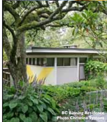
BC Binning Residence