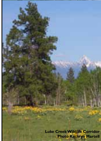
Luke Creek Wildlife Corridor