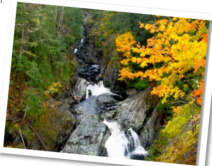
Sooke Potholes