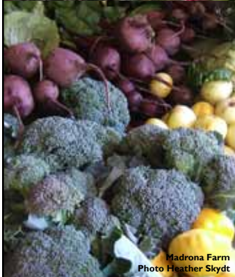
Madrona Farm