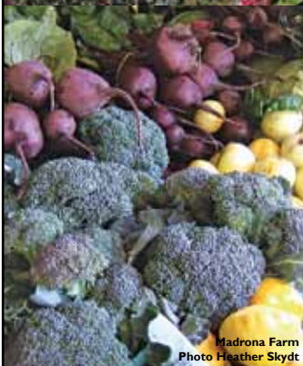
Madrona Farm