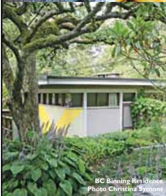
BC Binning Residence