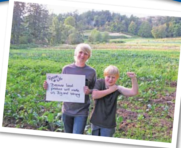
Madrona Farm

Island View Beach, Central Saanich (10.1 ha)