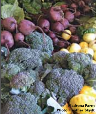
Madrona Farm