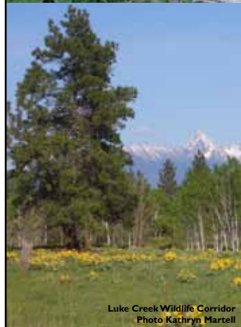
Luke Creek Wildlife Corridor