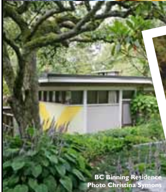
BC Binning Residence