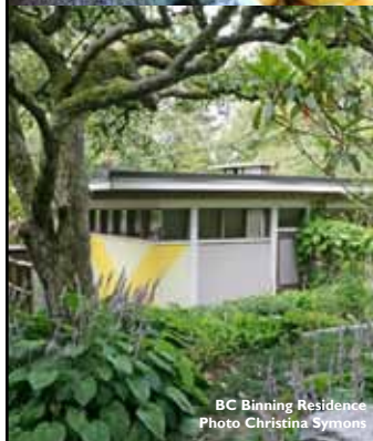
BC Binning Residence