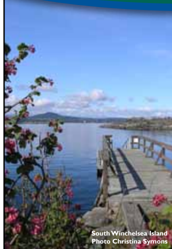
South Winchelsea Island

Keating Farm Estate, Duncan (11.1 ha) Second Lake, Highlands (73.0 ha) Eagle Bluff (SORCO), Oliver (2.5 ha) Laux Property, Farquhar (45.5 ha) Squamish Gravel Pit, Squamish (2.7 ha)